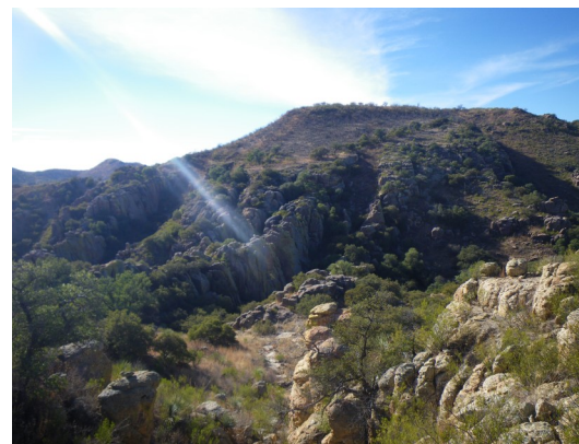
View of Box Canyon

We are excited for the possibilities of enriching the Circle Z experience for you, our guests. Stay tuned as we open new trails and add to our already fantastic riding program!